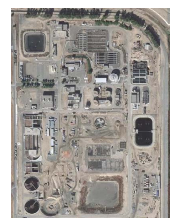
Moreno Valley Plant