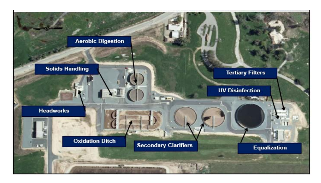
WRCRWA River Road Plant