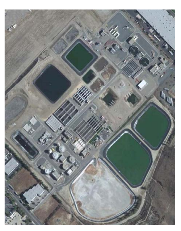
Temecula Valley Plant