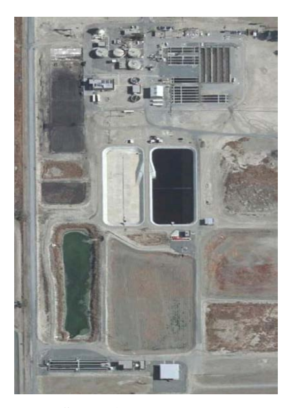
San Jacinto Valley Plant