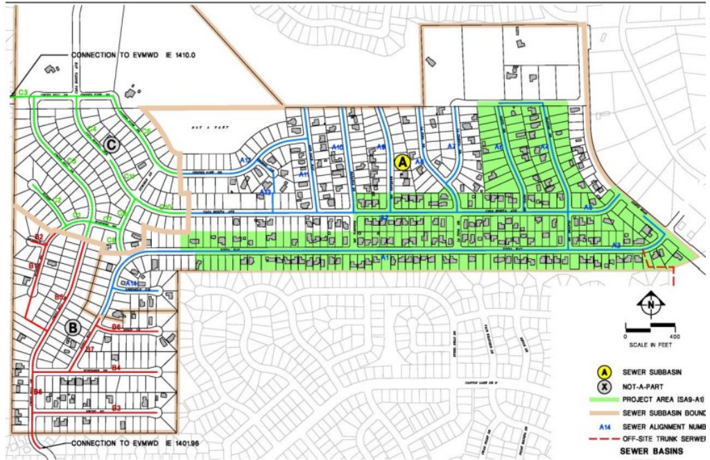
Subarea 9, Phase I