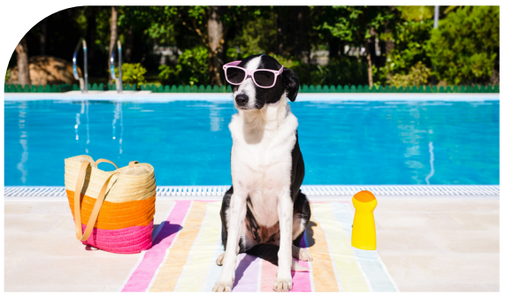
EMWD supports science-based standards that provide health benefits to the public in an economically balanced manner. Should more stringent standards be set, EMWD will meet them. EMWD's water has met and will continue to meet all regulations.