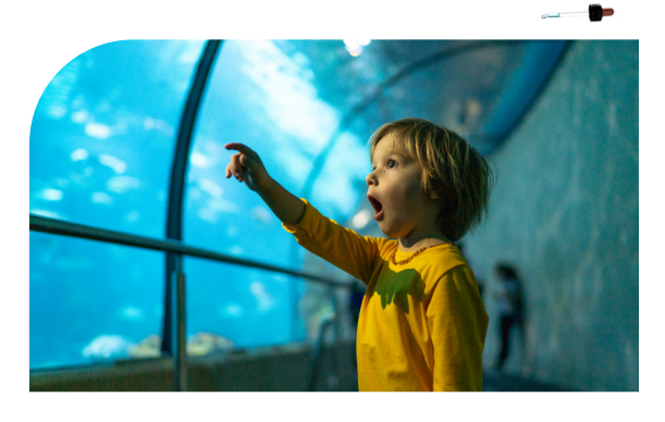
Unregulated contaminant monitoring helps EPA and the State Water Board determine where certain contaminants occur and whether the contaminants need to be regulated.

Represents 2020 Data Values Represents 2019 Data Values