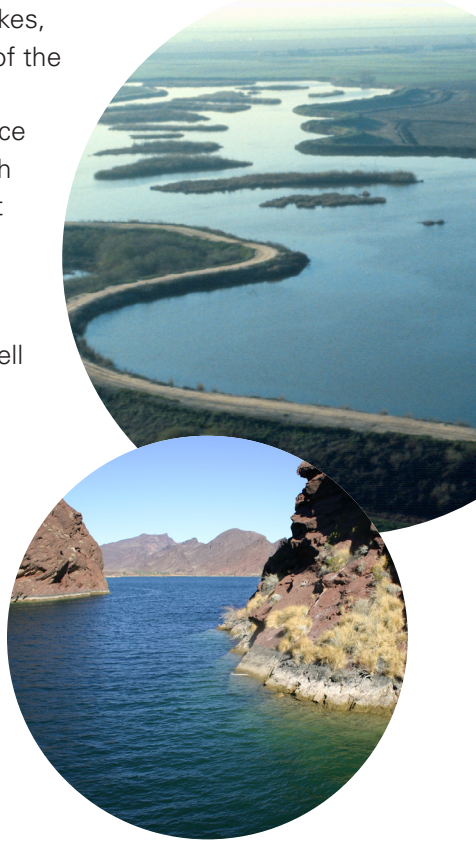
(Top photo) Northern California Delta, where the State Water Project originates.

An assessment of each of EMWD's wells was completed in 2013. Two sources were considered vulnerable to airports and airplane maintenance associated with a contaminant detected in the water supply. In addition, other EMWD wells were considered most vulnerable to the following (not associated with any contaminants): commercial and industrial activities, residential activities, agriculture, and other activities such as recreation and transportation.