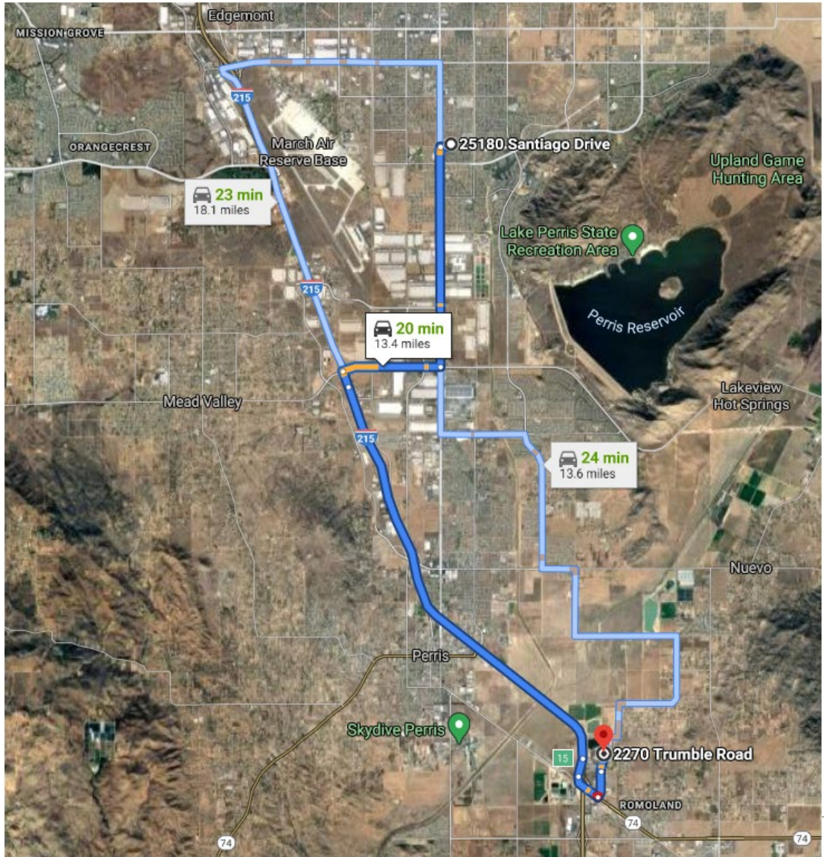
00016 Pre-Bid Walk-Thru Map/Directions