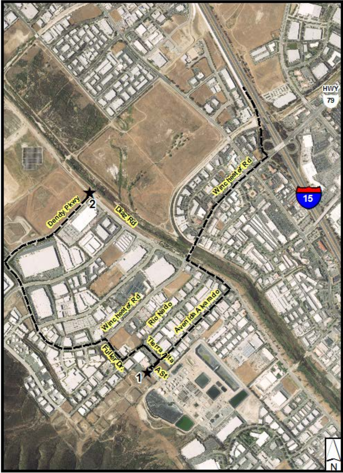
00016 Pre-Bid Walk-Thru Map/Directions