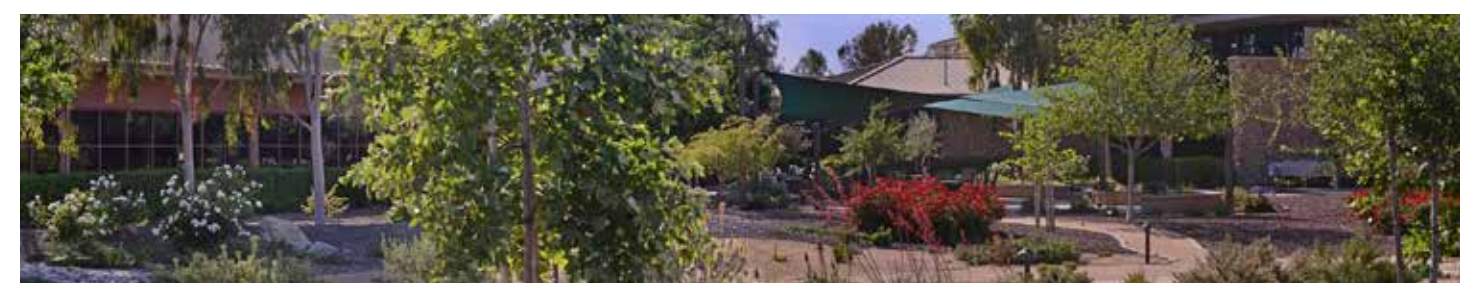
* Functional landscape areas include turf as a surface for recreation and sports fields. All other landscape areas are considered non-functional.

The Conservation Factor (CF) is based on a landscape's water use efficiency. A landscape with less grass and more lowwater landscaping along with more efficient irrigation systems would have a lower CF. When the CF decreases, so does the percentage of the evapotranspiration rate -- the varying amount of irrigation needed to keep plants alive, based on climate.