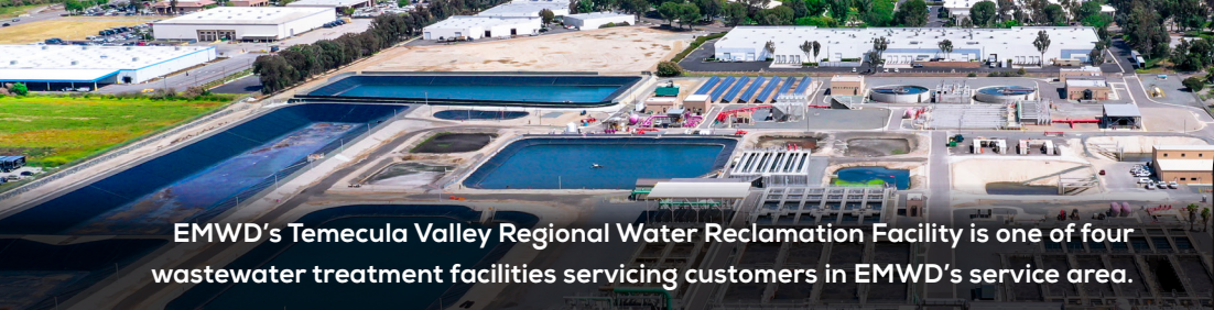
EMWD's Temecula Valley Regional Water Reclamation Facility is one of four wastewater treatment facilities servicing customers in EMWD's service area.