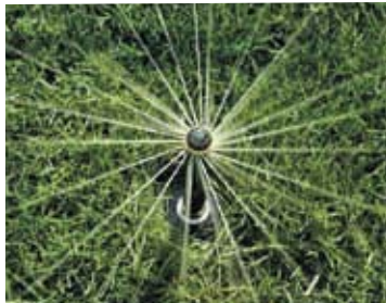
Replacing pop-up spray heads with rotating nozzles is simple and can be done in a matter of minutes.

For more info, visit www.emwd.org or call EMWD's Conservation Hotline at (951) 928-3777 ext. 4517.