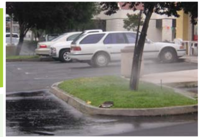
The ordinance will help eliminate water waste as pictured above.

EMWD is a proud supporter of a new landscaping ordinance that was recently adopted by Riverside County Supervisors.