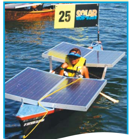
Preparing for qualifying rounds Solar Cup 2006

Held at Lake Skinner near Temecula, Solar Cup 2007 is open to the public and begins Friday, May 18, with opening ceremonies and qualifying rounds. On Saturday, May 19, using battery power, teams run sprint races on a 200-meter course. Sunday, the final day of Solar Cup 2007, begins with 90-minute endurance races and concludes with an awards ceremony.