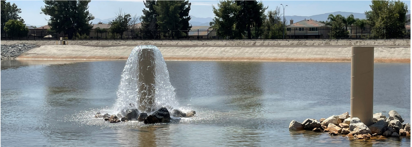
EMWD's Mountain Avenue West Groundwater Replenishment Basins in San Jacinto