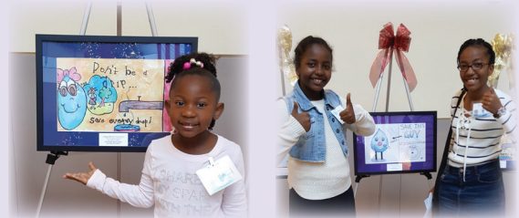
2017 Metropolitan Water District Poster Contest Winners

Each year, EMWD's Education Program sponsors a poster contest for grade school students within our service area and the winners are submitted for consideration in The Metropolitan Water District of Southern California's annual Water Is Life calendar.